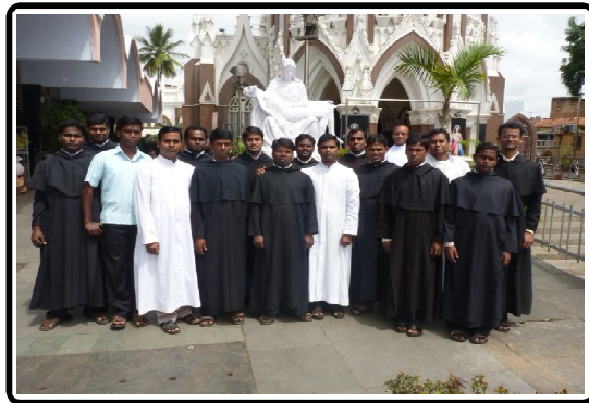
Jaya Matha Priory at the feet of St. Mary's Basilica of Shivajinagar in Bengaluru on the Solemnity of Sts. Peter and Paul the Apostles, 29 th June 2012

June 29 th is a special day for the whole Catholic Church as it celebrates the Solemnity of the two great Apostles Sts. Peter and Paul. This year, the same day brought a special grace upon all the members of Jaya Matha Priory, Bangaluru in India. On that day the whole new community made its maiden pilgrimage to St. Mary's Basilica of Shivajinagar in Bangaluru. It was a great moment to pray the Rosary at 10 a.m. under the feet of our Lady bearing witness to the pilgrims gathered there. The Rosary was offered for various needs of the Church, Order, Province, nation and community. And then there was the Holy Eucharistic celebration at 11 a.m. solemnly celebrated by the community fathers with the participation of so many pilgrims. The entire community could cherish the grace and blessing of God through the intercession of our Blessed Virgin Mary as the temporary professed friars had just began their ecclesiastical studies for this academic year 2012-2013. At the end of the day the whole community returned to the Priory with joyful hearts and thanked God for having blessed it with the pilgrimage on the beginning of the academic year.